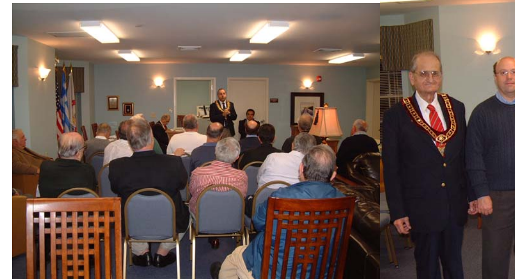
New London Winthrop Chapter #250